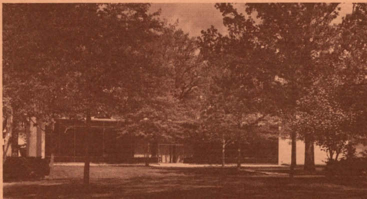
New Craft Building Toledo Museum of Art

Members, their families and friends will enjoy a Morning at the Toledo Museum of Art Luncheon in the dining room Afternoon visit to the Craft Building and a demonstration of glass blowing