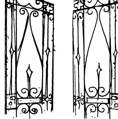
ENTRANCE GATE Frank B. Dyer Memorial