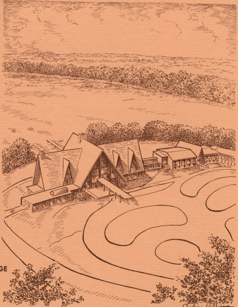
HUESTON WOODS LODGE STATE PARK, OXFORD